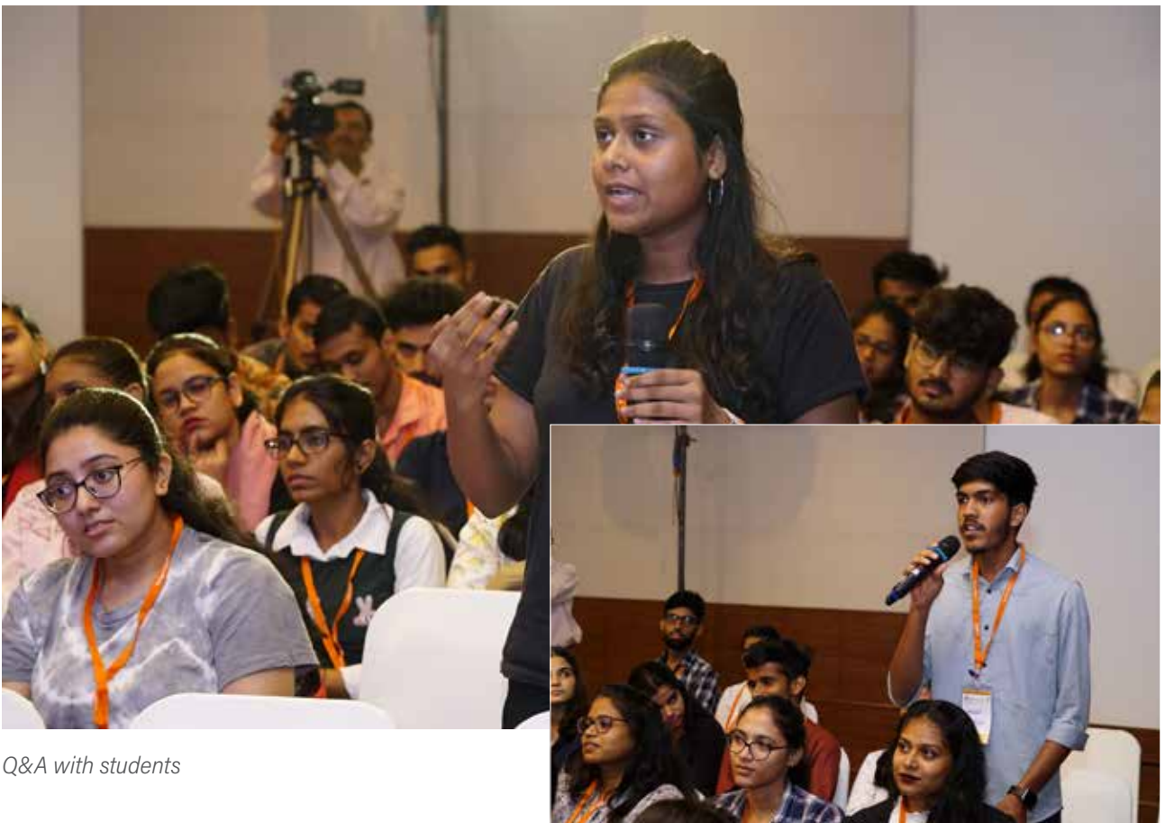
Q&A with students