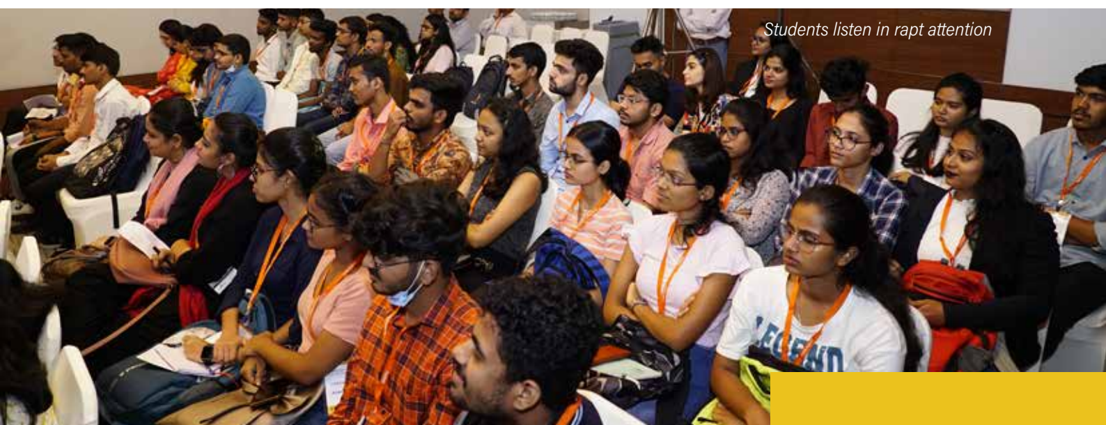
Students listen in rapt attention