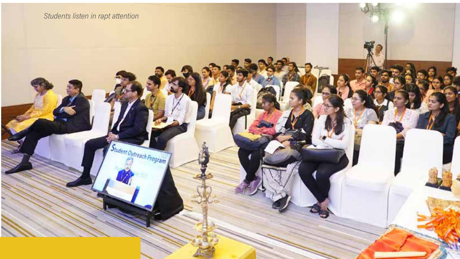
Students listen in rapt attention

More than 19000 industry professionals visited the 4 day tradeshow to experience latest technologies & equipment display by over 300 exhibitors & partners. Over 150 speakers of global acclaim deliberated over the topics of highest relevance in concurrent conferences on EPC, Refining & Petrochemicals, Specialty Chemicals, Industry Automation and Surface Engineering & Corrosion Control. Over 650 delegates attended the technical sessions and engaged with the key decision makers and subject matter experts. The industry leaders interacted with 200+ students of engineering & sciences during 2 days of Student Outreach Program.